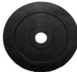
SINGLE - PIPE WIPER