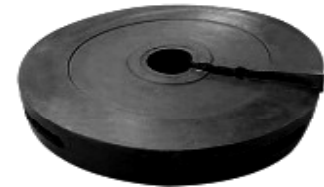
DUAL SPLIT - PIPE WIPER