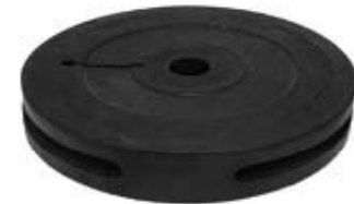
DUAL SOLID - PIPE WIPER