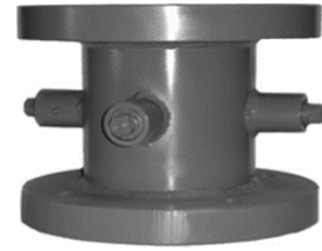
HALL TYPE STRIPPER