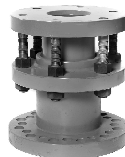
TX-JU TUBING STRIPPER

The housing of the type 'TXJU' stripper is machined with a flanged bottom connection for easy attachment of API flanges. Six 1 1/8" stud bolts transmit tubing load from the packing gland to the housing. These bolts also provide the means of adjusting the packing rubber, allowing three inches of travel for adjustment and take-up wear. The rubber may also be adjusted easily by backing off the stud nuts and setting tubing weight on top of the stripper. The flat top provides a suitable base for any Guiberson or type "G" Oil Country Tubing Spider.