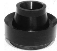
HALL STRIPPER RUBBER